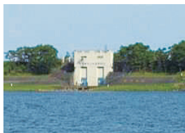
Nagoya city water intake structure