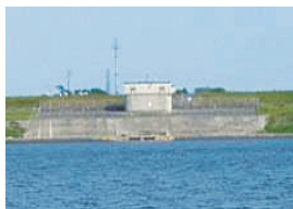
Aichi prefecture water intake structure